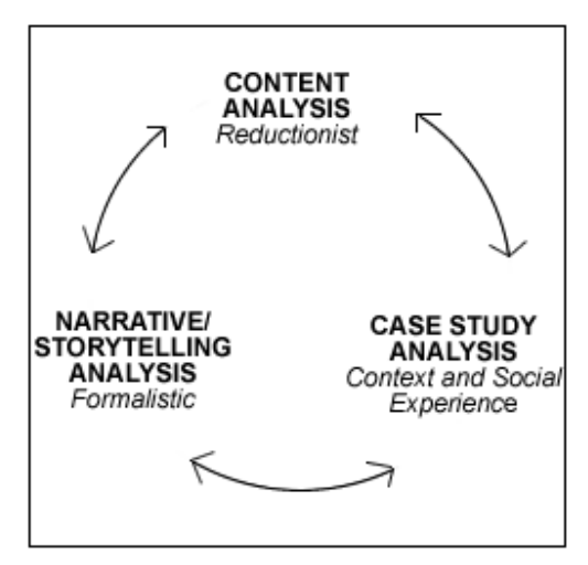
Figure 2: Three integrated approaches for interpreting data from learning logs

analysis, or some combination of the three (Friesner and Hart 2005).